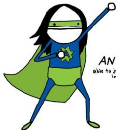
ANXIETY GIRL! able to jump to the worst conclusion in a single bound!